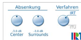
Fig.3: GUI of the downmix tool with control buttons for attenuating the surround channels and the centre